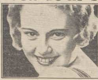
Pimples, Spots, Coarse Blotched Skin now Easy to Avoid—say specialists.

Thousands of women are now relying upon Cuticura alone as their external aid to skin health and beauty. Pimples, blackheads, enlarged pores, irritations: 'muddy,' coarse rough skin all yield to this scientific treatment which every woman can carry out daily at little cost. The woman is now was seen and heals and quickly clears the skin.