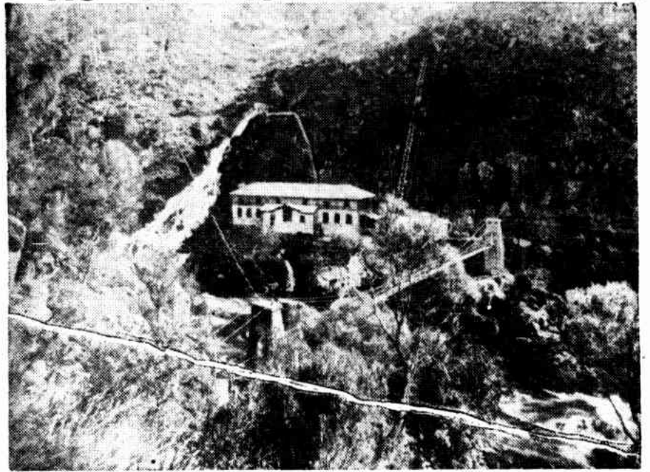
An old picture of the Duck Reach power station which supplied Launceston with power from 1895, and is now an auxiliary plant.