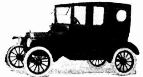
The famous Model "T," of which more than 15,000,000, were sold all over the world.