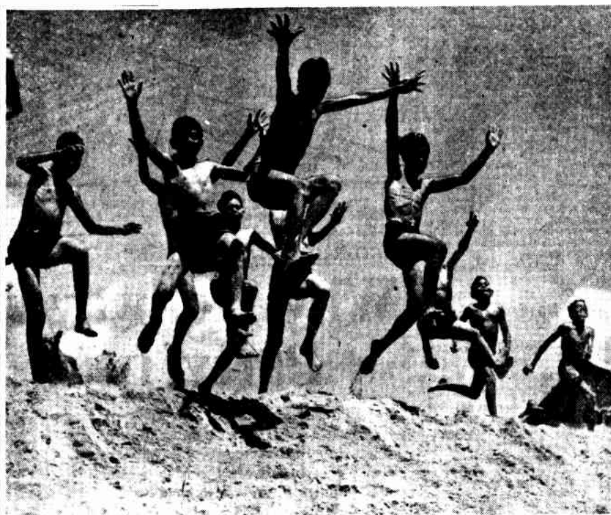
With leaps of excitement these aboriginal children rush down the beach at Collaroy for their first swim in an ocean yesterday. They are some of 90 native children from the far west of the State who are holidaying at the Salvation Army camp, Collaroy, under the care of the Aborigines Welfare Board. They had never seen a boat, train or sea before they came to Sydney.